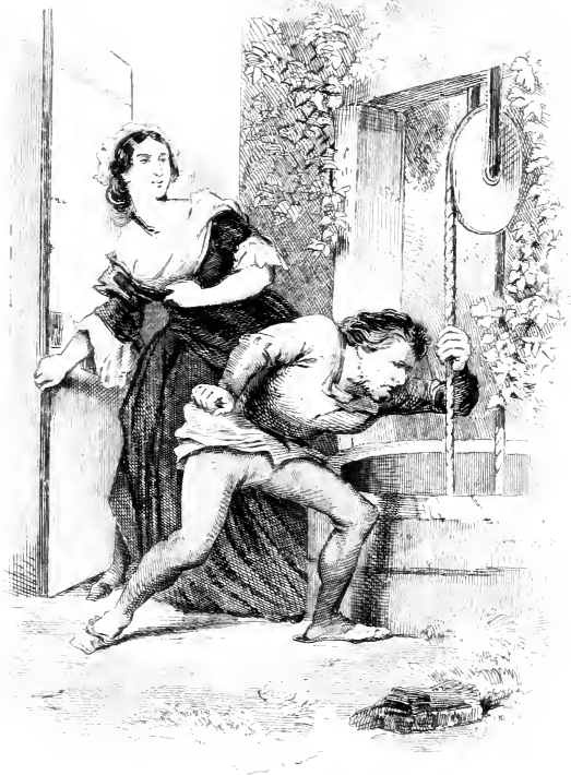
THE MAN WHO WAS HUNG